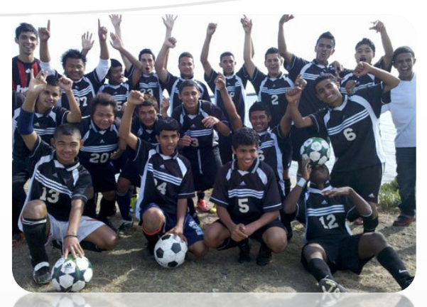
SWB Oakland IHS Boys, Undefeated Season Fall

SWB Oakland, Refugee Transitions and the International Rescue Committee shared major successes in Summer 2010. SWB partnered with Refugee Transitions to lead the first annual San Jose Refugee Community Soccer Camp. Fifty miles north in San Francisco, SWB and the International Rescue Committee united over 80 resettled refugees to compete in the first annual Bay Area Refugee World Cup.