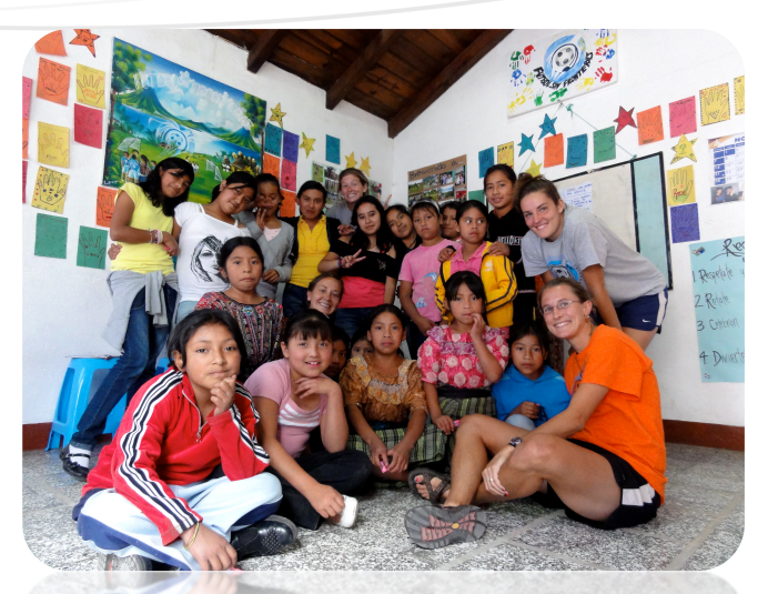
Inte<mark>rns an</mark>d Girls at the Office, Sololá, Guatemala

SWB Ndejje expanded its outreach to include seven new schools in Ndejje, reaching more than 1,000 youth through in-school programming. In addition to providing tutoring and mentorship opportunities in school, SWB hosts soccer practices and educational workshops after school. In nearby Kampala, SWB continued its support of more than 300 urban refugees living in the Katwe and Nsambya areas.